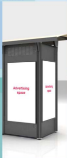
Structure for advertising panel on the back of the furniture