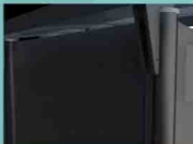
Structure for back advertising panel