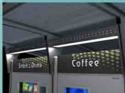
Light fixture without ceiling