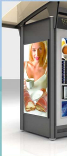
Structure for advertising panel on side abutment of the furniture