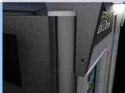
Columns in estruded Aluminium